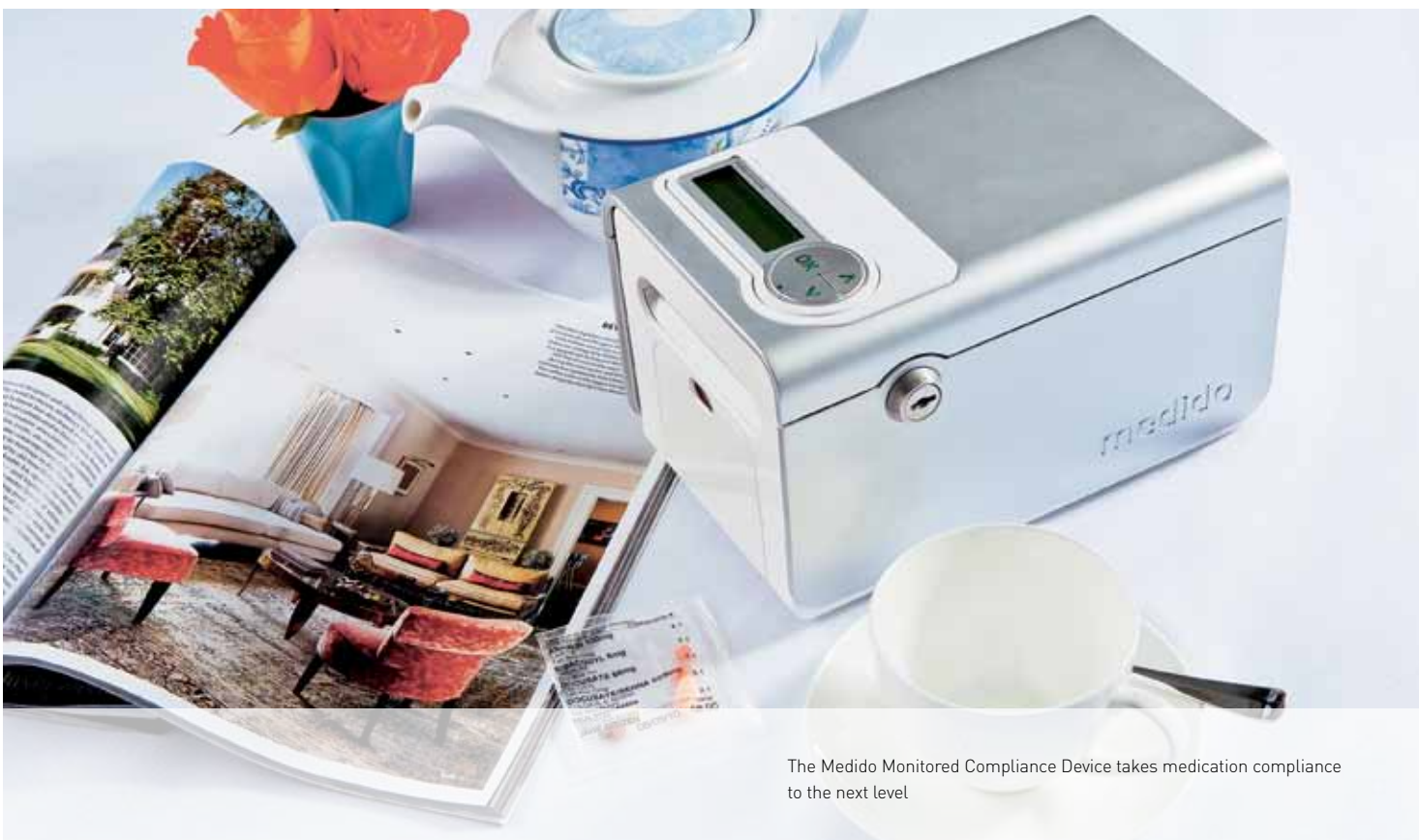
The Medido Monitored Compliance Device takes medication compliance to the next level