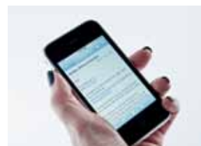
If a person fails to eject their medication sachet within a nominated period of time the device alerts a care giver for follow up