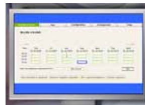
Dose times are entered into a web portal, which communicates with the device via mobile phone technology. This enables the device to alert a person when their medication is due