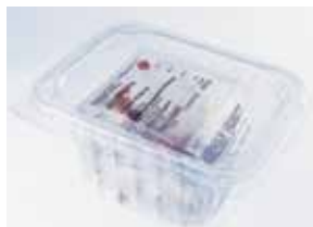
A person receives their weekly roll of dose administration sachets ready for loading into the Medido

“This device not only helps her remember to take her medication, but enables me to ‘check in with her’ without invading her privacy.”