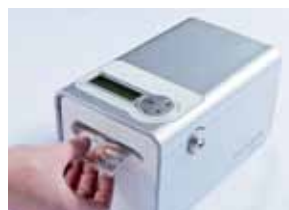
On ejecting, the device cuts the sachet. This assists a person to easily access their medication