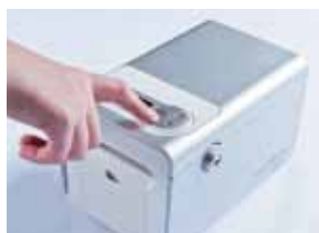
Alarms are both audio and visual, with the ability to also set custom alarms for non-packed medications