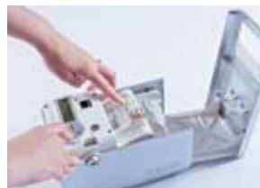
A person's dose administration sachets are fed into the device, which is controlled via a secure, user-friendly web portal